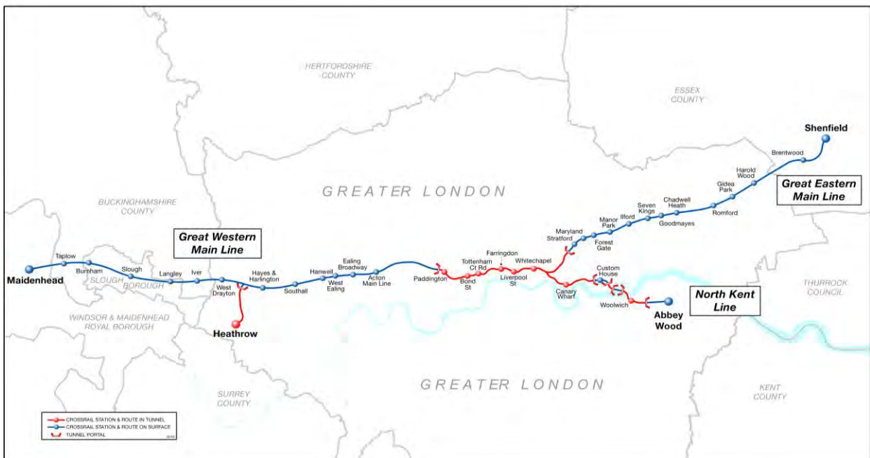
Figure 1: Crossrail scope