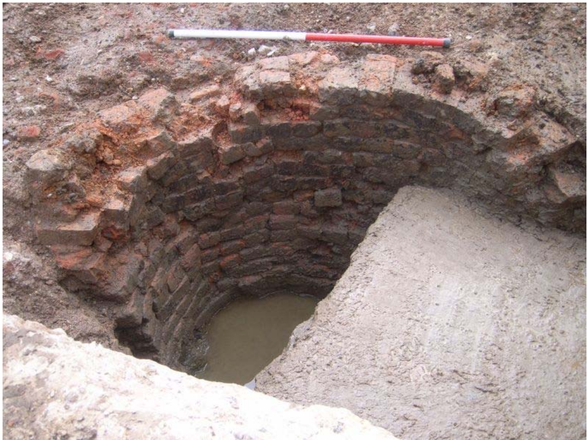
Plate 3 View of Well 3005, looking south-west