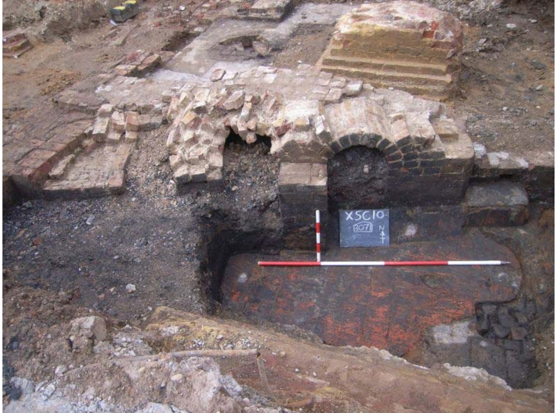
Plate 4: General view of the industrial remains in the south-east corner of site, looking north

2.1.22 The earliest phase appeared to be the brick structure (3071), which was comprised of walls and vaulted voids that formed three parallel arched chambers with brick floors. The origin of this structure is postulated as being in the late 18th century, on the basis that the lime-rich buff-coloured mortar used to bond the brickwork was more common then. Certainly the later phases display a different mortar. The form of the structure and its subsequent use indicate that it was used for heating, and the hypothesis is that it could be part of a furnace system. The furnace may have been related to nearby premises, and maps of the late 18th century show stables in the vicinity. This structure could have been part of an iron foundry, blacksmiths or farriers.