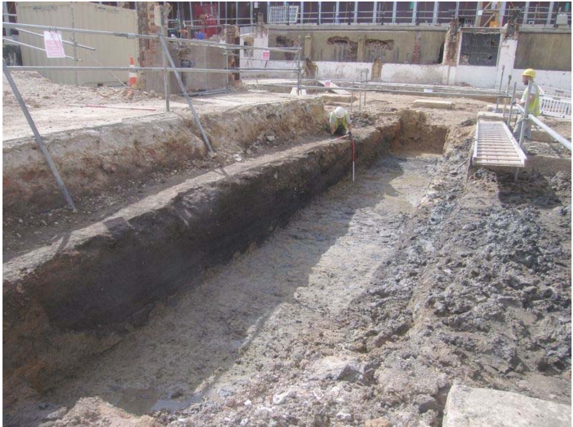
Plate 2: View of the section through the upper Tyburn river deposits, looking south-west