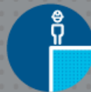
WORKING AT HEIGHT