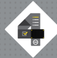
FOLLOW THE REQUIREMENTS