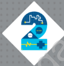
ASSESS THE RISKS