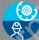
PEOPLE & PLANT