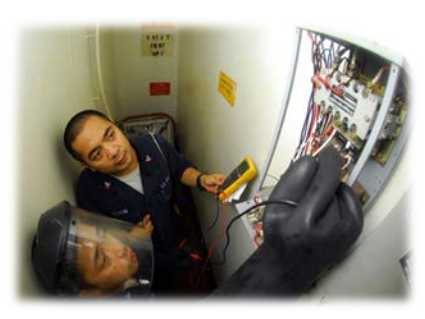
Electrics: 40 days