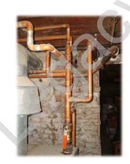
Plumbing: 50 days