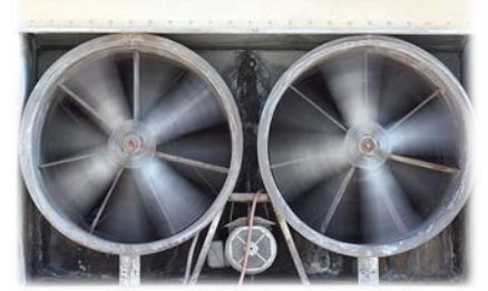
Heating/Air Con: 65 days