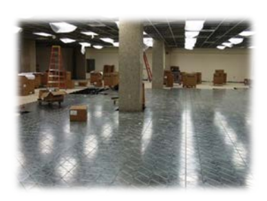
Flooring: 35 days