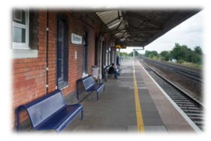
Brick work: 100 days