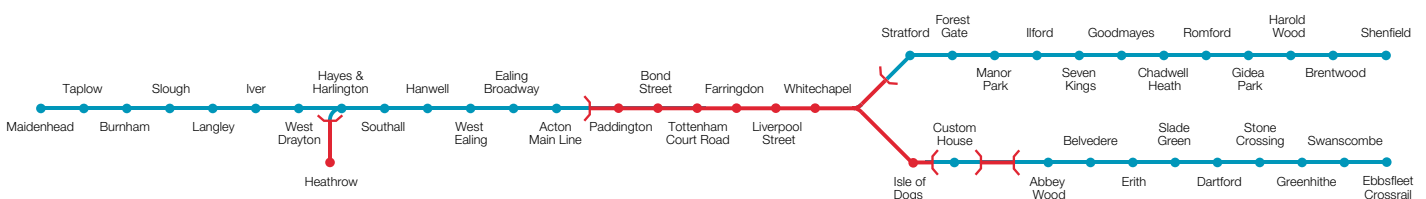
Preferred Route Map