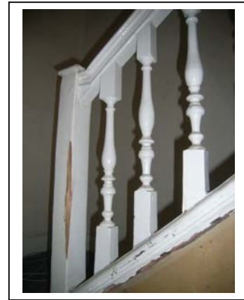
Plate 5: stairs in 5a Great Chapel St

2.3.3 The main focus of the work at 5a Great Chapel Street was the surviving staircase which has been dated by Charles Brooking to the 1730s and it either appears that the building was almost entirely reconstructed around it or the staircase was dismantled and re-erected within the late 19th-century building. The uppermost section of the staircase (up to 3rd floor) is plainer than the staircase below, presumably reflecting the lower status of the rooms in the upper part of the house. At this level the balusters have a square section unlike the turned balusters in the lower flights. The plainer upper section of staircase is believed to be primary and shares some similar detailing to the main stairs, such as the same handrail and newel post.