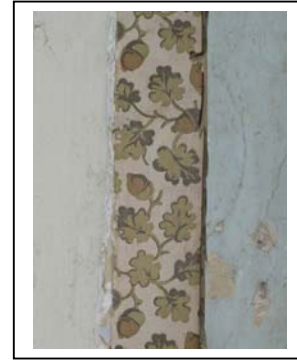
Plate 7: exposed fragment of wall paper in 5a Great Chapel Street

2.3.5 Other interesting features exposed by the works include fragments of attractive floral wallpaper, exposed by the removal of later abutting partitions, at ground, first and 2nd floor level within the hall adjacent to the stairs. There is no evidence of the wallpaper continuing up to third floor, which again may be evidence of the upper storey's relatively low status.