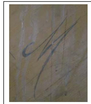
Plate 6: Exposed 'signature' on stair rail in 5a Great Chapel Street

2.3.4 There is also an attractive and distinctive 'M' written on the uppermost side rail. This has recently been exposed by the removal of a covering board and it has an elaborate form with curled flourishes (see Pl.6). The structural rail would have been behind a facing board and would almost certainly never have been visible so it may well be that this 'M' is the initial of the original carpenter who wanted to add his signature.