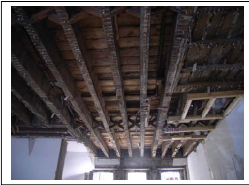
Plate 3 exposed joists in 96 Dean St