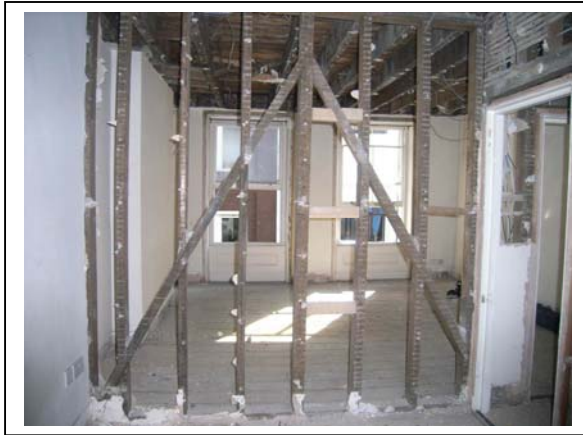
Plate 1: Partition frame in 94 Dean Street