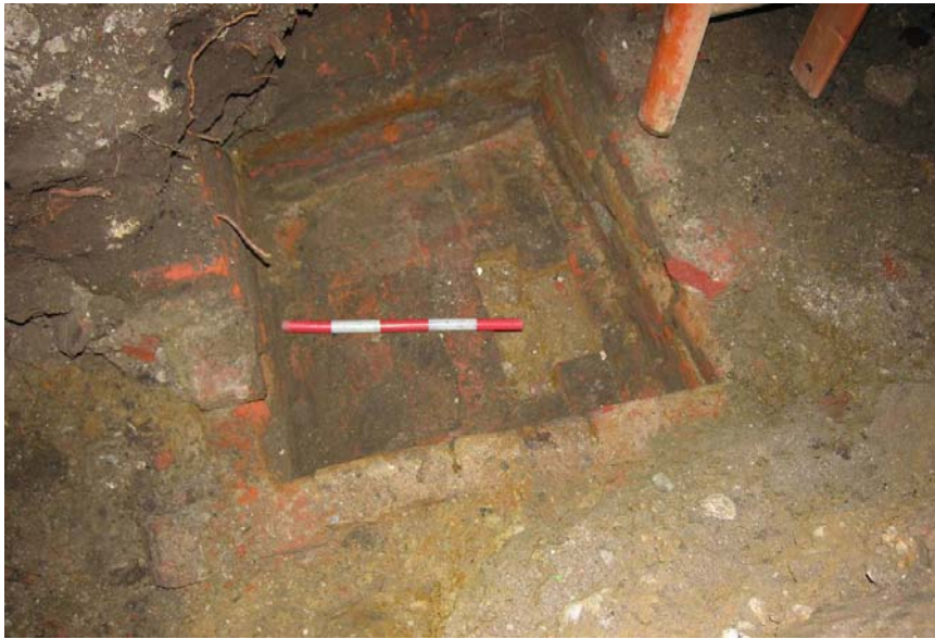
Photo 3, RBS structural trench looking west. Brick cess/rubbish pit truncating natural between 2.30 and 2.97m bGL.