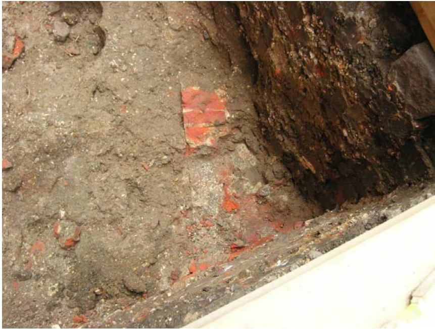
Photo 2, RBS structural trench looking east. 19th-century wall remnant [67]