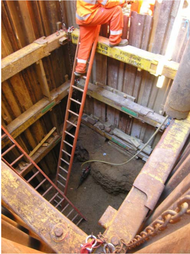
Photo 1, RBS structural trench looking north. Natural sandy gravels exposed between 2.9 and 4m bGL