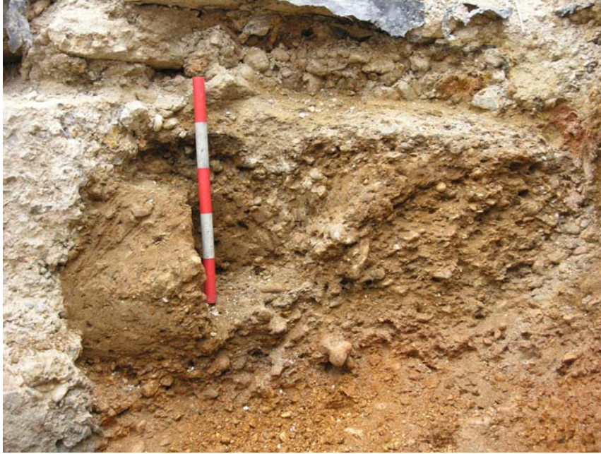
Photo 12, Trench 7, looking north. Pit [14] cutting natural gravels to 13.54m OD (113.54m ATD), provisionally Roman.