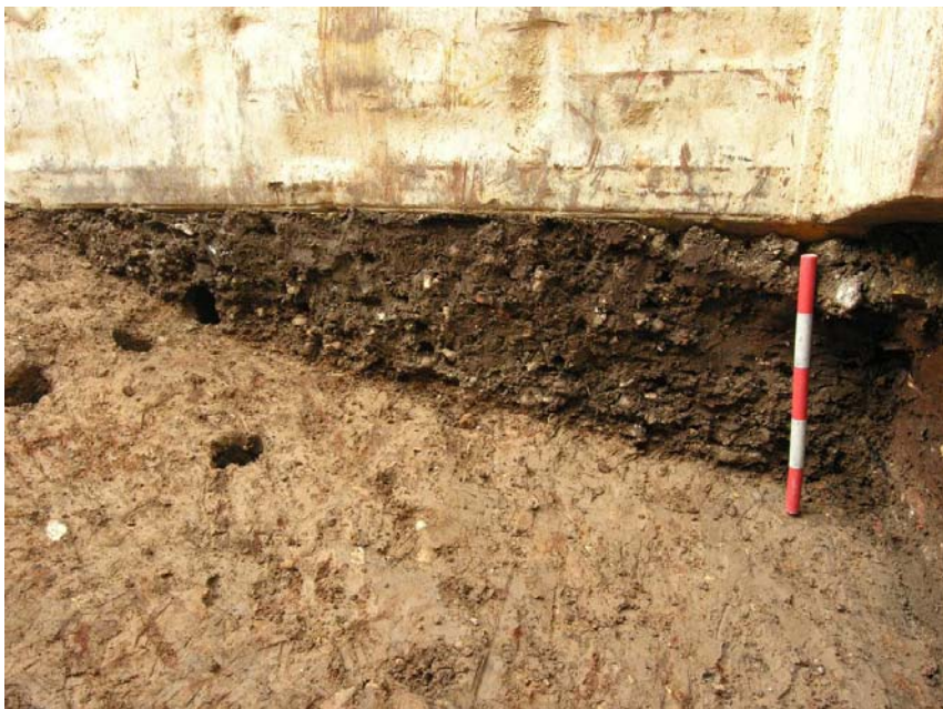
Photo 6, Trench 3, looking west. East-facing section of ditch [55].