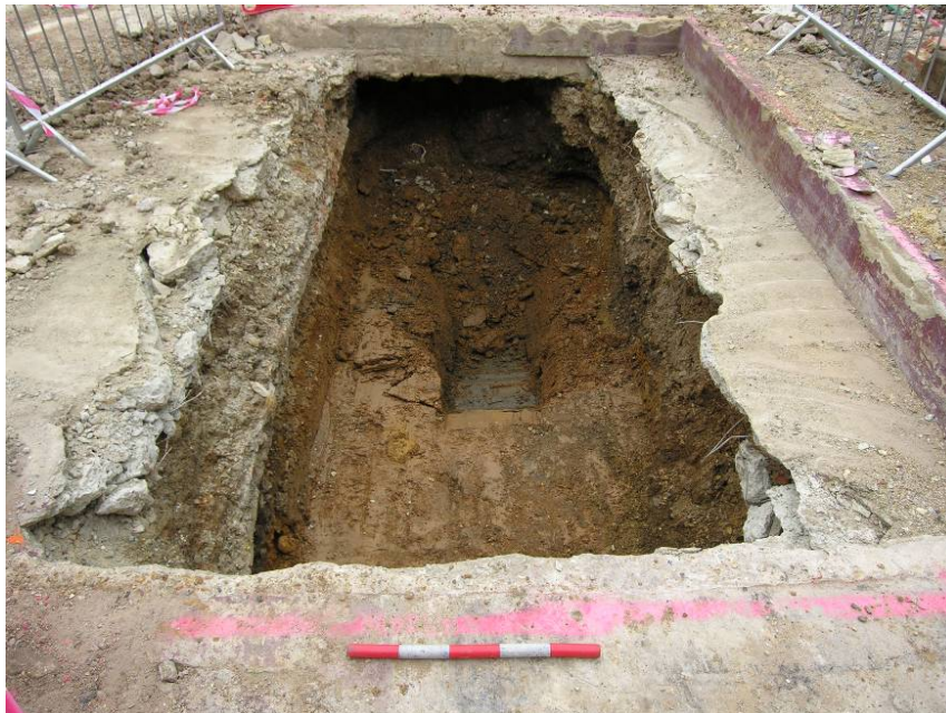
Photo 10, Trench 6, looking north. natural weathered London Clay (orange brown) overlying London Clay (in sondage, grey) at 11.90m OD (111.90m ATD).