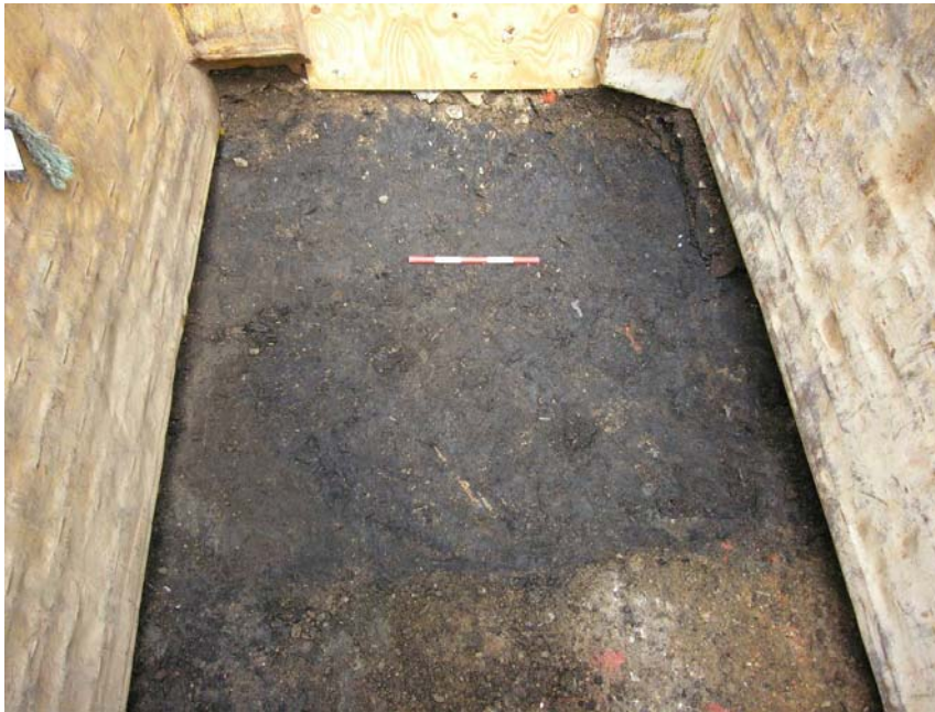
Photo 2, Trench 2, Looking north. Semi-terrestrial marsh like deposit [27] at 112.50m ATD, with 19th-century concrete and brick intrusion [8].