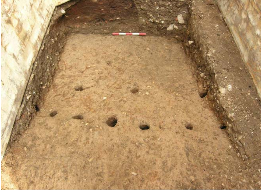
Photo 5, Trench 3, looking north. Ditch cut and two phases of timber revetment

The latest fill [32] may have been created during periods of inundation forming a organic semi-terrestrial waterlain deposit, within which roots and textiles were well preserved.