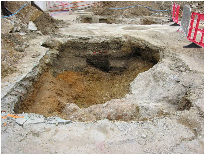
Photo 9, Trench 5, looking north. Modern concrete and brick intrusion, with late post medieval ditch/cut [16].