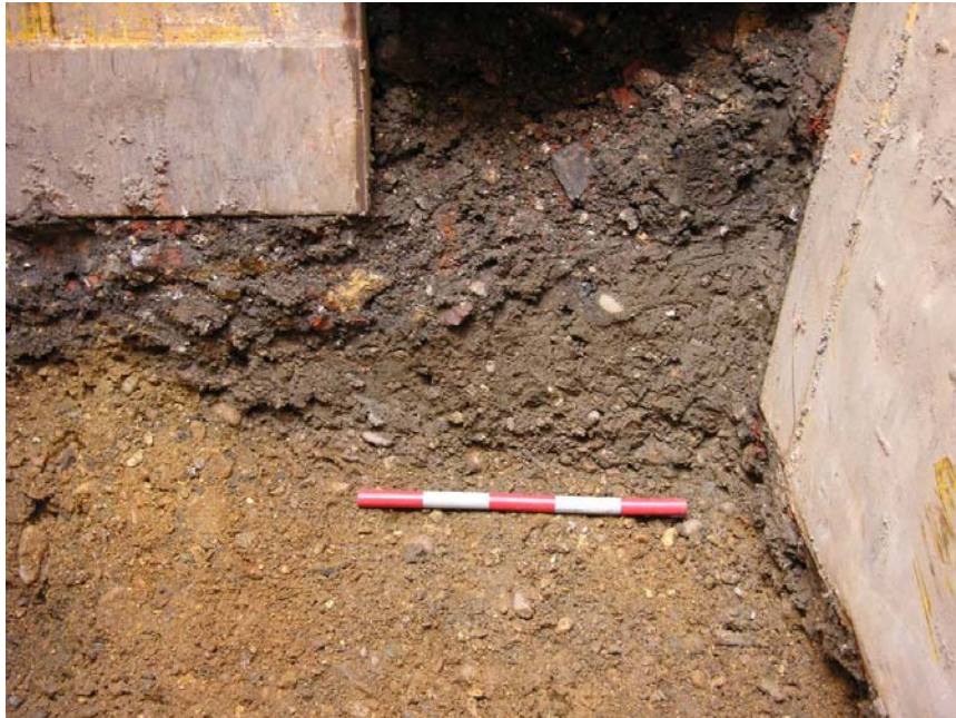
Photo 1, Trench 1, looking east. Ditch cut [57] truncating natural sandy gravels.