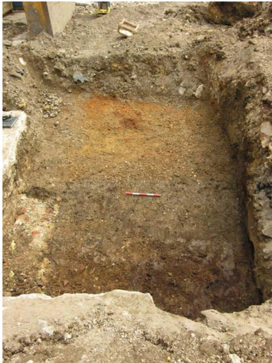
Photo 4, Trench 3, Looking south. East-west aligned ditch cut [55] visible at 0.65m bGL cutting natural gravels.