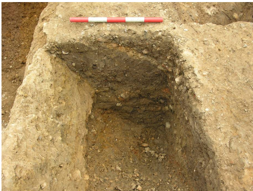
Photo 8, Trench 4, looking east. Sectioned post-medieval pit cut [4], with evidence of tip lines [3].