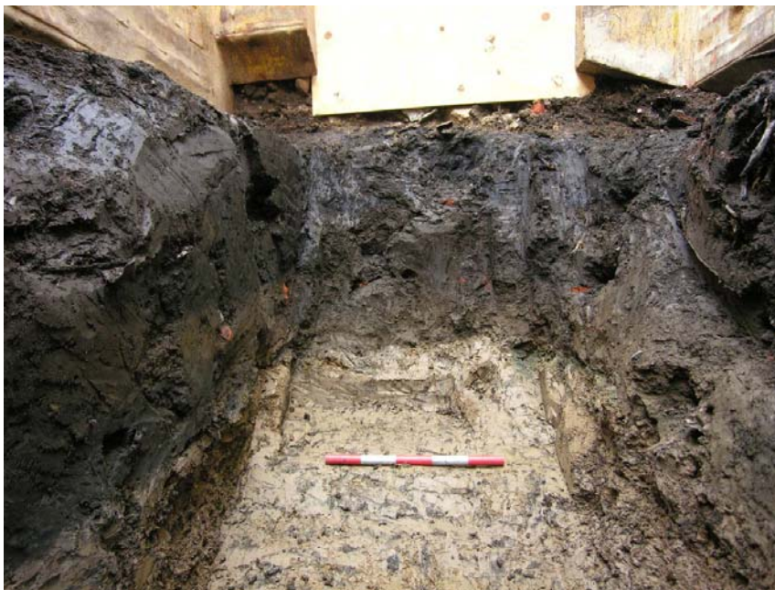
Photo 3, Trench 2, looking north. Deposit [27] overlying a series of increasingly silty clay layers [28] & [29]. Weathered natural brickearth visible at base.

Culvert [22] of approximately 18th-century date, running along the northern edge of the trench appears to have been repaired or extended during the 19th century. A small brick soakaway survived immediately below the slab at 14.16m OD (114.16m ATD), which had been horizontally truncated by later 19th-century buildings [7].