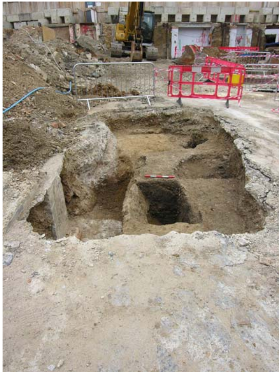
Photo 7, Trench 4, Looking east. Half-sectioned intercutting post-medieval pits [2] & [4], with Roman (provisionally) circular cut feature [6] in background.