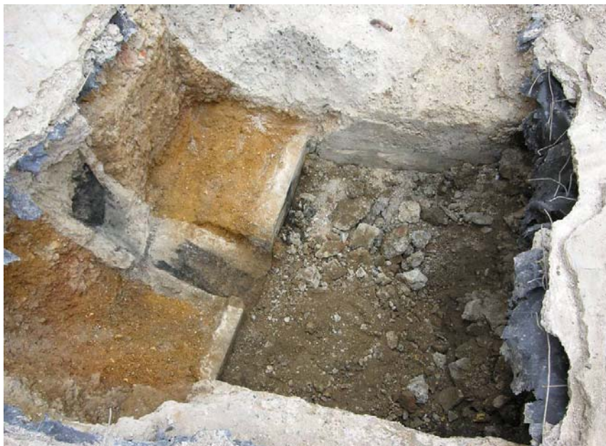
Photo 11, Trench 7, looking south. 19/20th-century backfilled basement and associated coal chute, truncating natural gravels.