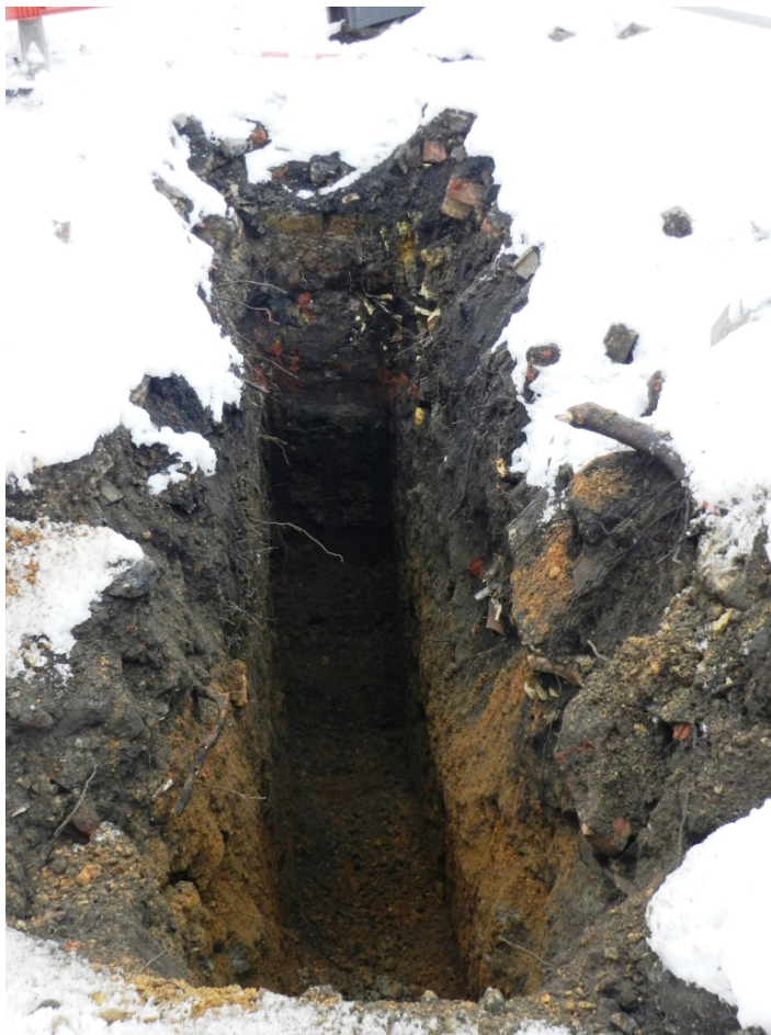
Photo 2 Natural terrace gravel exposed below reworked gravels (looking west)