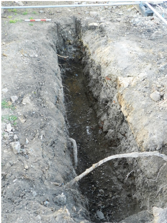
Photo 4 Trial Pit Looking South