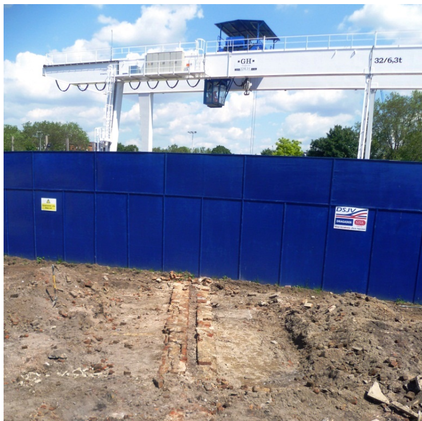
Photo 16 Walls made of “Tudor-style” 2-inch thick bricks in area south of previous site boundary