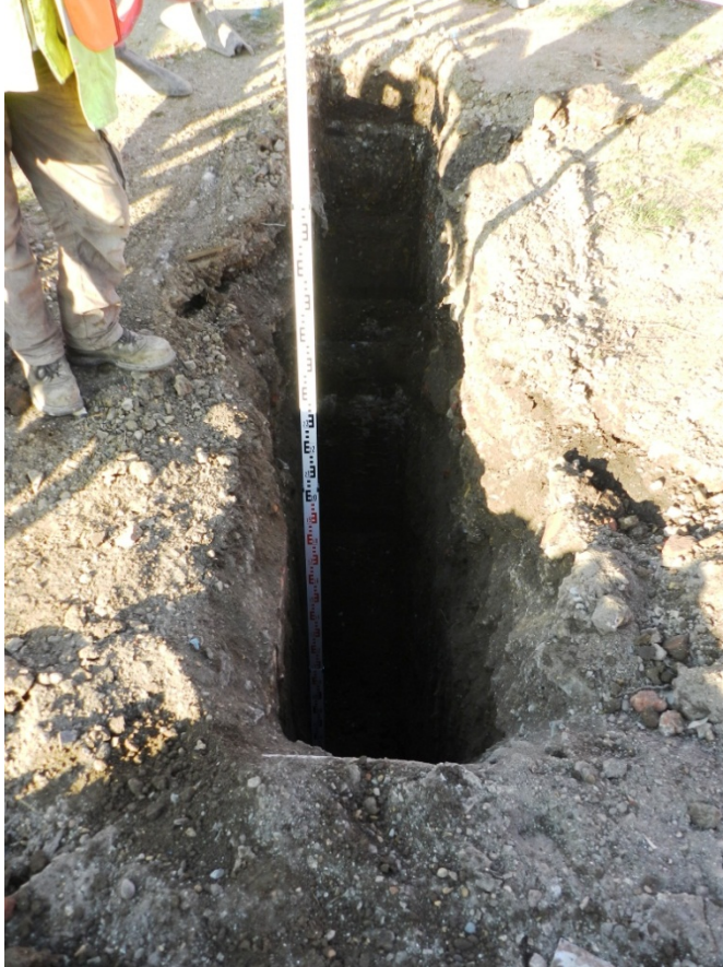
Photo 1 Coal-ashy fills in TP1 looking north