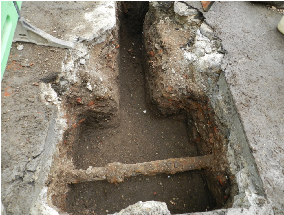
Photo 11 Water main, initial trench to connect to existing pipe, subsequently enlarged