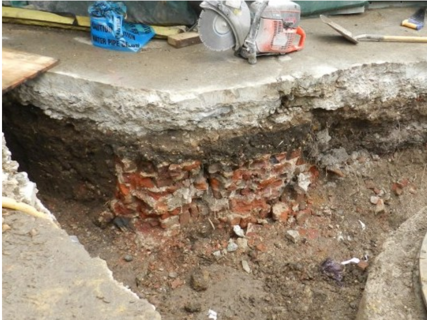
Photo 9 Wall made from Tudor-style 2-inch thick bricks east side of new manhole