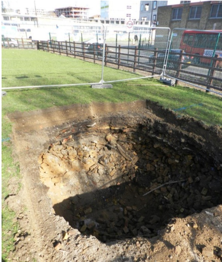
Photo 6 Northern soakaway, looking north to Stepney Green Boys School