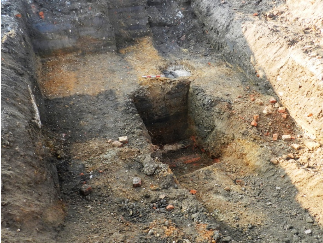
Photo 5 Southern Soakaway looking west

The area of the proposed soakaway, later cess pits are dark grey, culvert exposed in central sondage. The white patch near the 0.5m scale is a permeability test