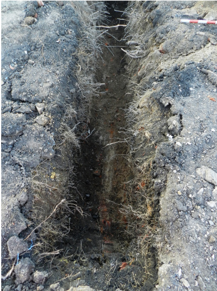
Photo 3 Trial Pit 3 looking south, on the east side of the craft building. A nineteenth-century brick coal cellar dug through landfill deposits of similar age, at 109.1m ATD