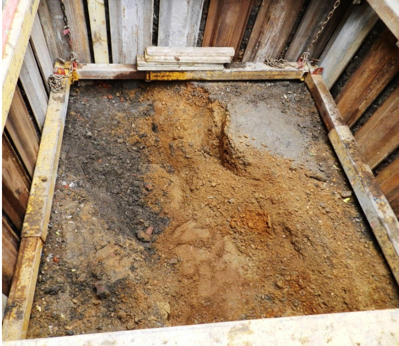
Photo 10 Full depth of temporary drainage manhole. Coal-ashy fills [322] continuing