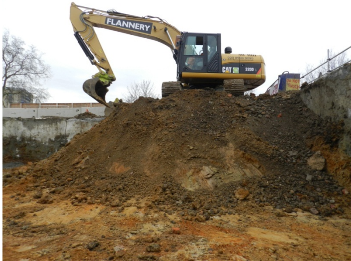
Photo 14 bulk excavation of south area of shaft