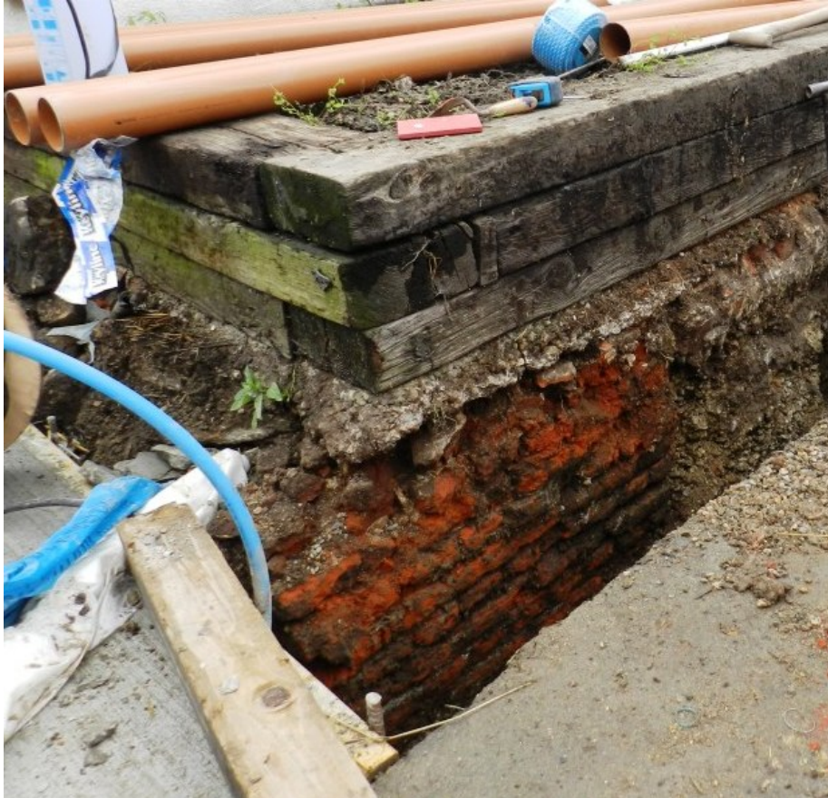
Photo 7 Wall made of Tudor-style bricks [331] beneath the raised bed west of City Farm offices