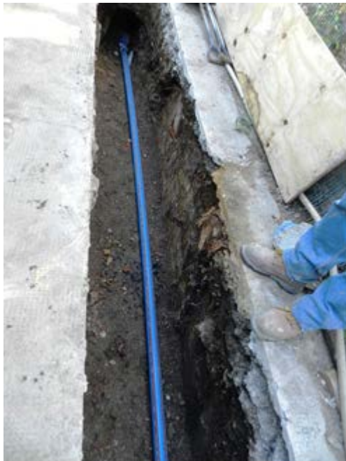
Photo 12 Trench on east side of king John Street (site entrance) in the pavement