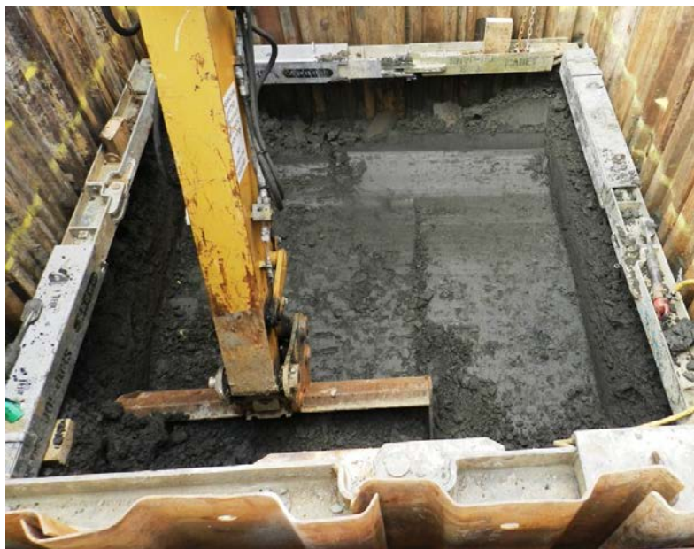
Photo 1 London Clay at 102.9m ATD