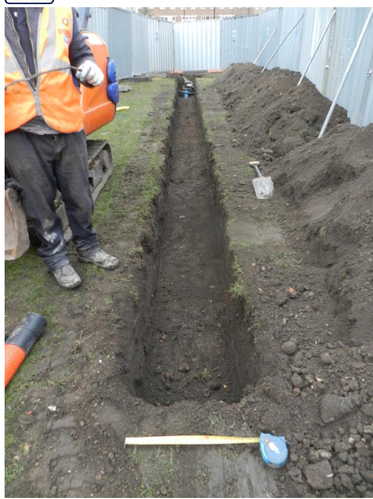
Photo 9 shallow pipe trench exposing garden soil deposits, looking east