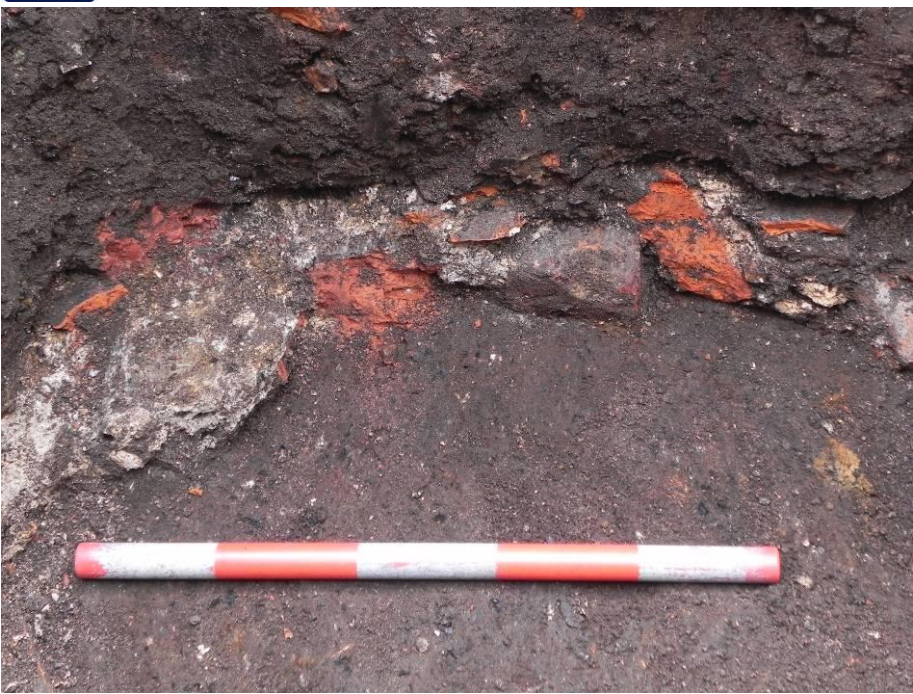
Photo 5, detail of starter pit for borehole WH_60 showing tiled floor remnant [124], looking south