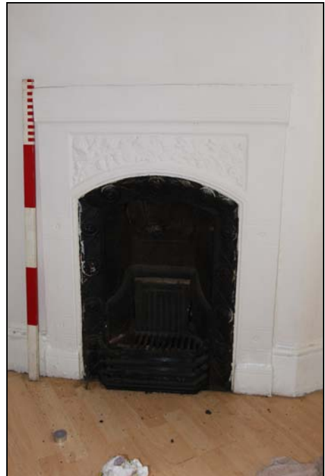
Figure 8: Detail of fireplace in 9 Diadem Court

Sheffield Office: Unit R6, Riverside Block, Sheaf Bank Business Park, Prospect Road, Sheffield S2 3EN. Tel: 0114 255 9774 Maidstone Office: The Malthouse, The Oast, Weaving Street, Maidstone, Kent ME14 5JN. Tel: +44(0) 1622 739381