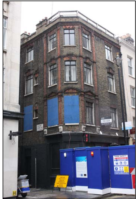
Figure 6: General view of 93 Dean Street