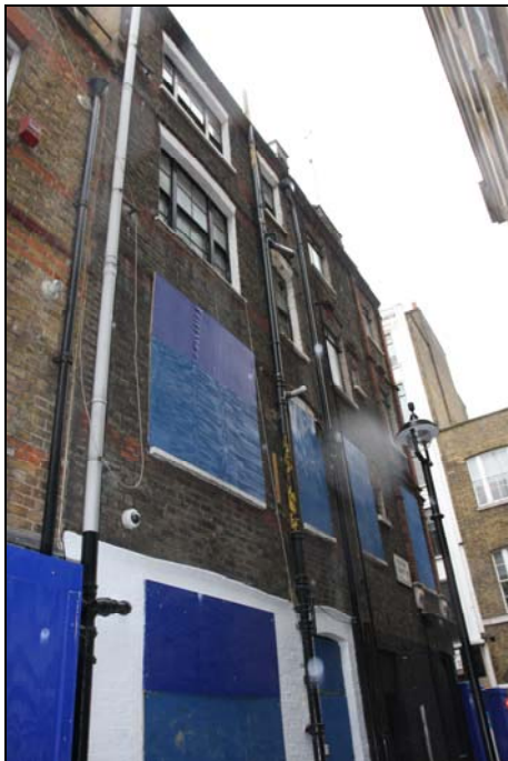
Figure 7: General view of 9 Diadem Court