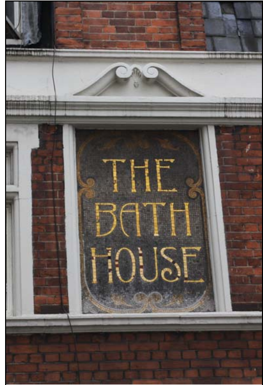
Figure 3: Detail of signage on north elevation of The Bath House