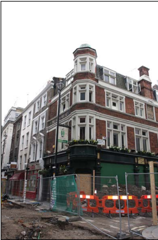
Figure 2: General view of The Bath House

Tel: 01722 326867 Fax: 01722 337562 info@wessexarch.co.uk www.wessexarch.co.uk