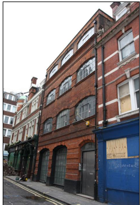
Figure 12: General view of 2-3 Fareham Street

Sheffield Office: Unit R6, Riverside Block, Sheaf Bank Business Park, Prospect Road, Sheffield S2 3EN. Tel: 0114 255 9774 Maidstone Office: The Malthouse, The Oast, Weaving Street, Maidstone, Kent ME14 5JN. Tel: +44(0) 1622 739381