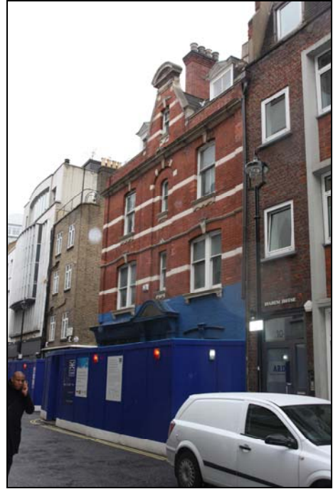
Figure 10: General view of 9 Great Chapel Street