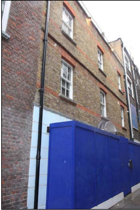
Figure 9: General view of 3 Diadem Court

Tel: 01722 326867 Fax: 01722 337562 info@wessexarch.co.uk www.wessexarch.co.uk