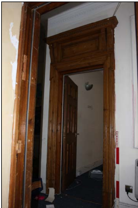
Figure 11: Detail of doorcases in 9 Great Chapel Street