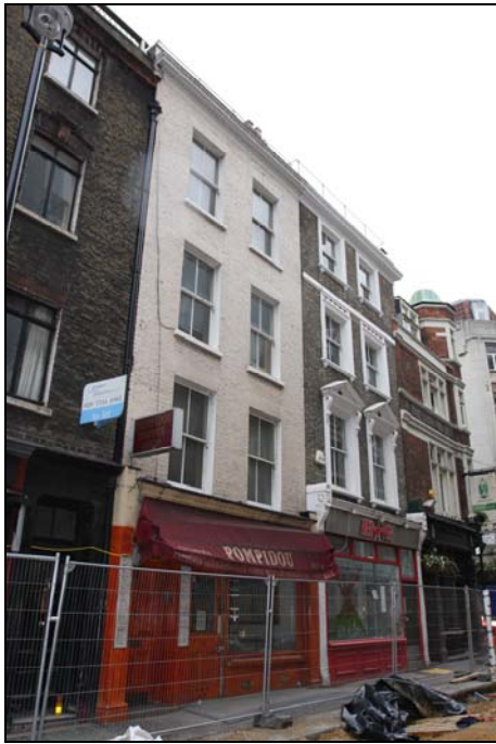
Figure 5: General view of 95 Dean Street

Tel: 01722 326867 Fax: 01722 337562 info@wessexarch.co.uk www.wessexarch.co.uk