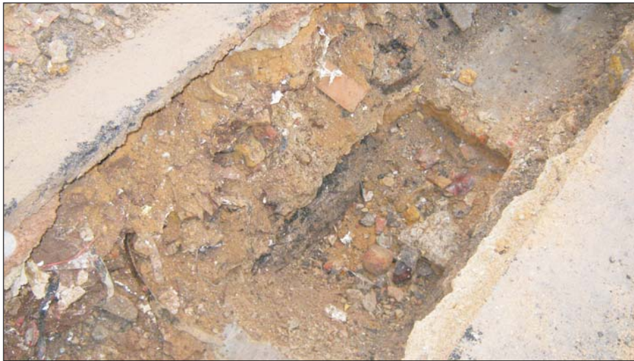
Plate 1: West face of Trench 1 showing general sequence of deposits with post medieval soil at the base