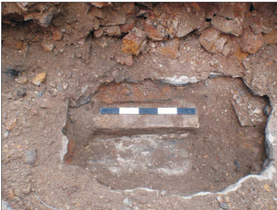
Plate 2: West face of Trench 2 showing pillar base of possibly related to Albion Brewery

This material is for client report only. No unauthorised reproduction.