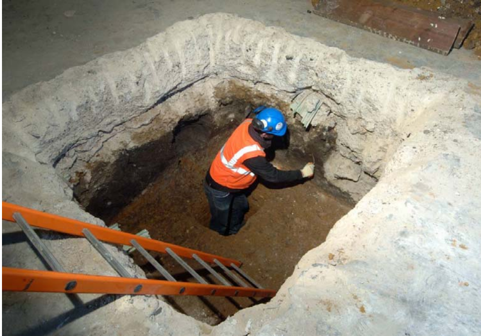
Evaluation Trench 6 looking south, showing archaeological layers [1],[2]and [3] in section and probably natural brickearth [6] at the base of the test pit and in small test hole.