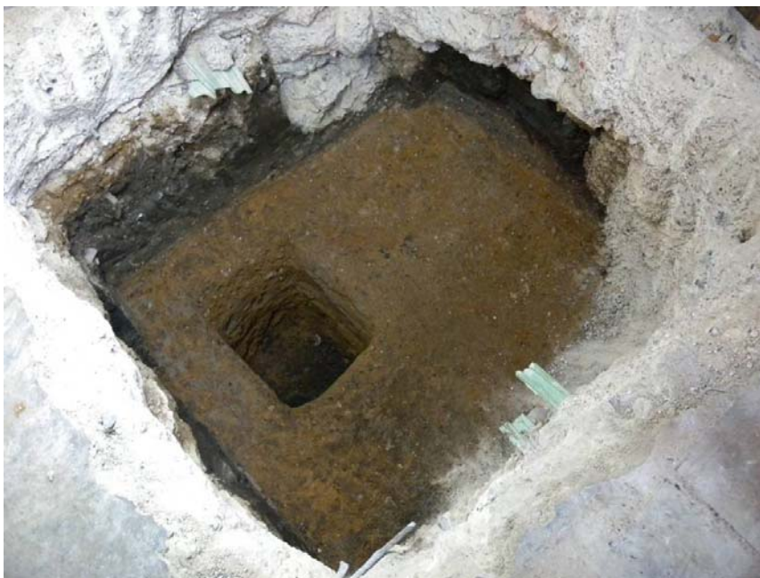
Natural brickearth in the base of trench 6, looking west